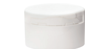
Flip Top SSQZ TE (membrane)