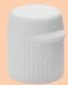
Ribbed Flip top