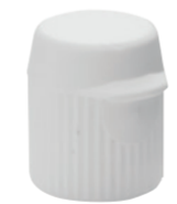
Ribbed Flip top