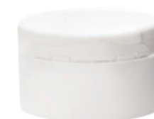
Flip Top SSQZ TE (membrane)